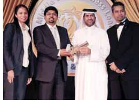
Middle East Business Leaders Award 2010 Environment Sector