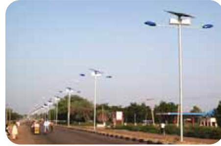
Solar Street Lighting Yobe State, Nigeria