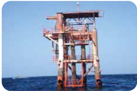
Solar Oil & Gas Systems RAK PETROLEUM, RAK, UAE