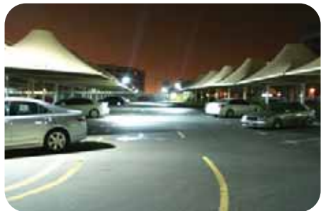
Solar Carpark Lighting DOZ, Dubai, UAE