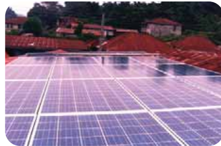
Solar Power System Nigeria, Africa