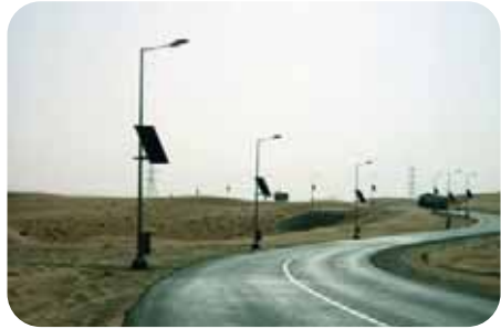
Solar Road Lighting PETROFAC, Abu Dhabi, UAE