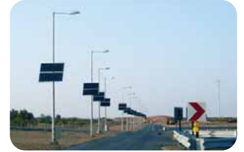
Solar Road Lighting DOPA, Al Ain, UAE