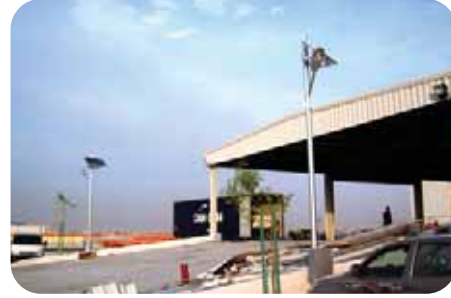
Solar Yard Lighting AL ROSTAMANI, Dubai, UAE