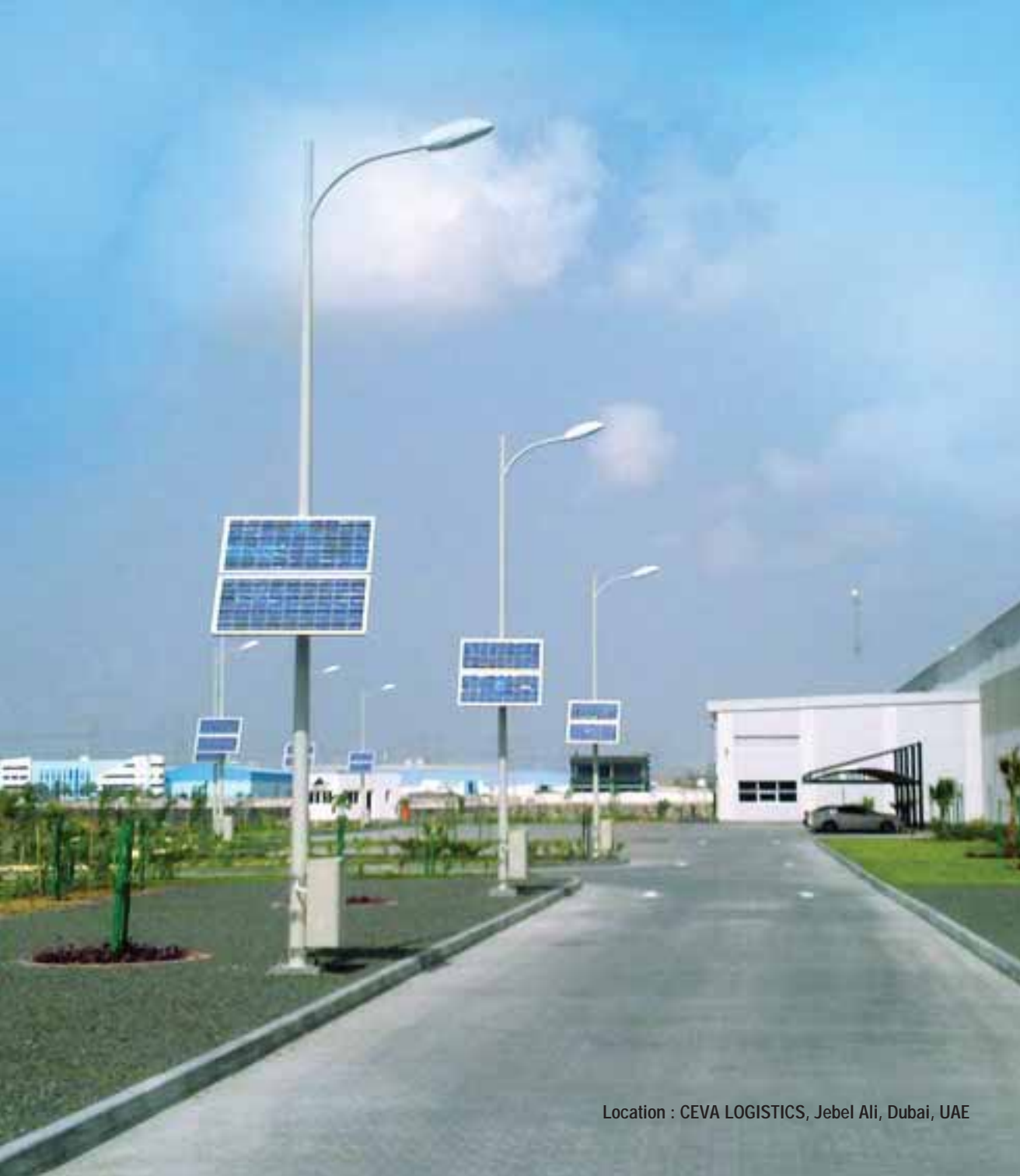
Location : CEVA LOGISTICS, Jebel Ali, Dubai, UAE