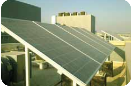
Solar Building Power Systems ARCAN, Dubai, UAE