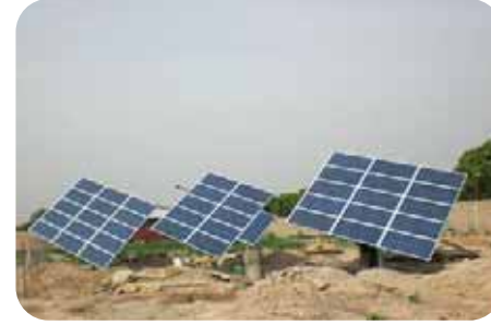
Solar Irrigation Systems Mali, Africa