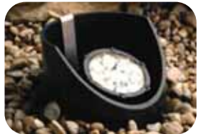
PTL LED6WL / 9WL