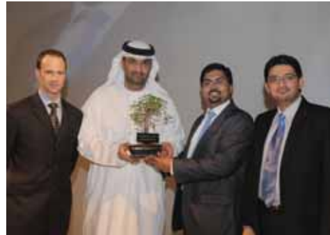
The Alternative Energy Awards 2008 Environmental Contribution of the Year