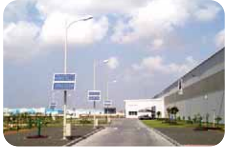
Solar Pathway Lighting CEVA LOGISTICS, Dubai, UAE