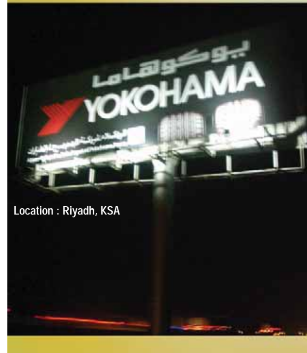
Location : Riyadh, KSA