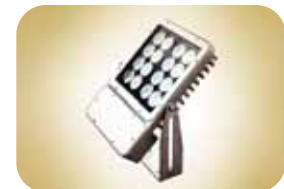
PTL LED PL