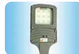
PTL-LED 12W / 12V