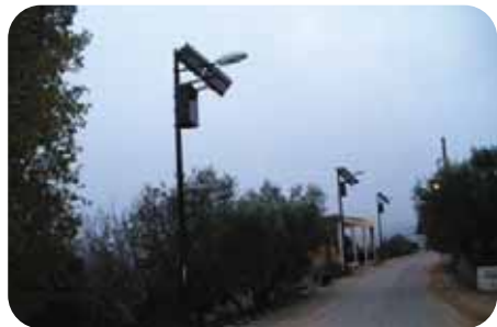
Solar Street Lighting UNDP, Lebanon