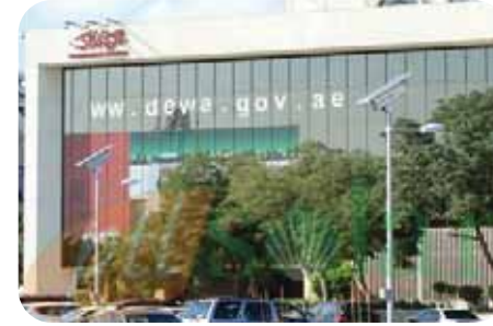
Solar Carpark Lighting DEWA, Dubai, UAE