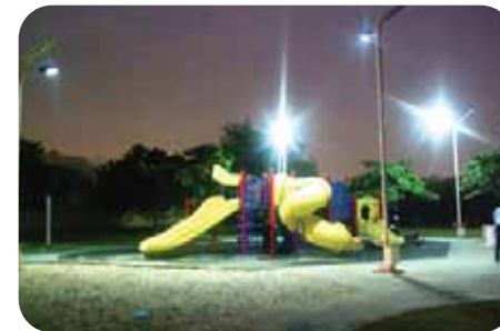
Solar Park Lighting AMERICAN UNIVERSITY, Sharjah, UAE