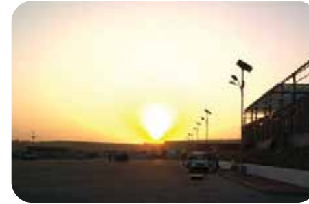
Solar Yard Lighting SCANIA CV, Dubai, UAE