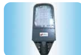
PTL-LED 60W / 24V