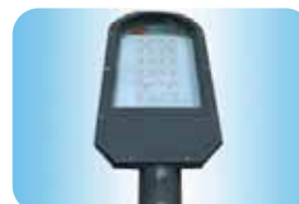
PTL-LED 48W / 24V