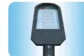
PTL-LED 36W / 12V