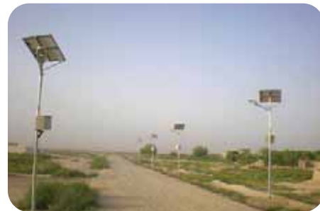
Solar Road Lighting CANADIAN DEFENCE, Afghanistan