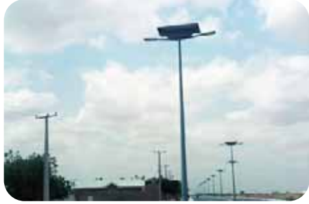
Solar Road Lighting Sudan, East Africa