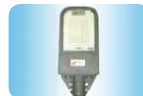
PTL-LED 72W / 24V