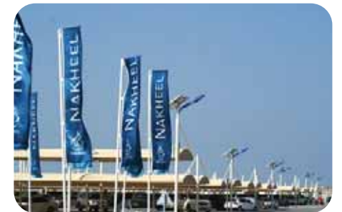
Solar Carpark Lighting NAKHEEL, Dubai, UAE