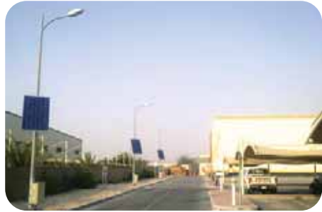
Solar Road Lighting UNILEVER, Dubai, UAE