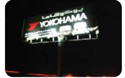
Solar Billboard Lighting Riyadh, KSA