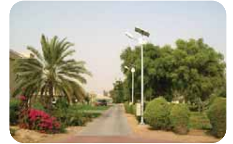
Solar Pathway Lighting AL KAMDA, Dubai, UAE