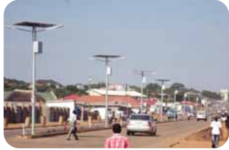
Solar Street Lighting Juba, South Sudan, East Africa