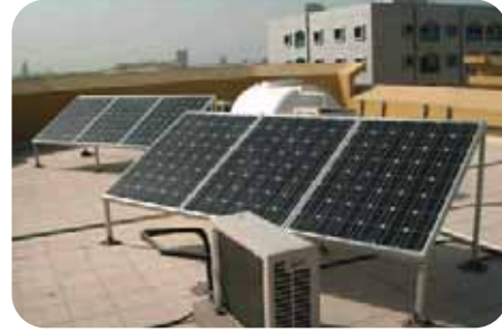
Solar Home Power System Ajman, UAE