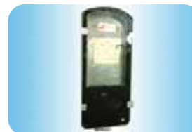
PTL-LED 9W / 12V