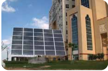
Solar Tracker System ACADEMIC CITY, Dubai, UAE