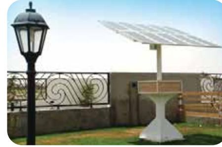
Solar Garden Lighting Sharjah, UAE