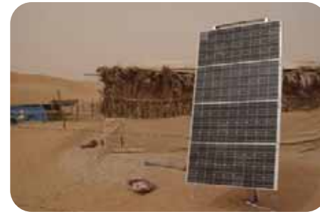
Solar Power System Abu Dhabi, UAE