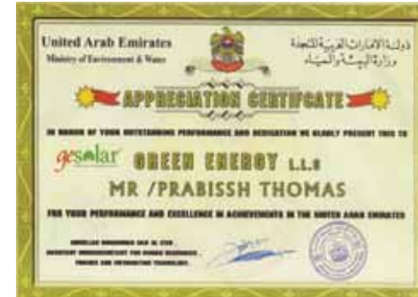
Appreciation Certificate Ministry of Environment and Water, UAE