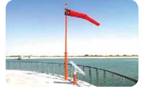
Solar Powered WindSock YAS MARINA, Abu Dhabi, UAE