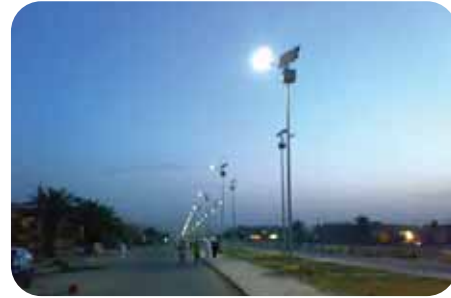
Solar Street Lighting US ARMY, Iraq