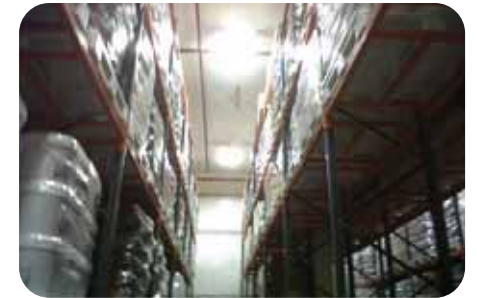
Warehouse Lighting Dubai, UAE