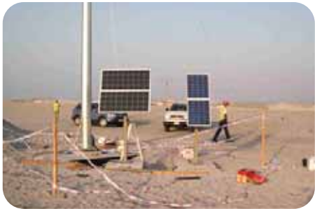
Solar Security Systems SIEMENS, Dubai, UAE