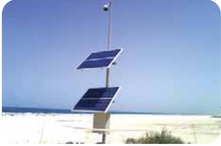
Solar Powered CCTV Camera DUBAL, Dubai, UAE