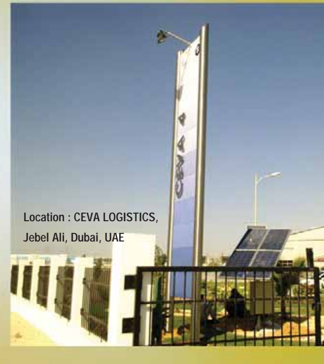
Location : CEVA LOGISTICS, Jebel Ali, Dubai, UAE