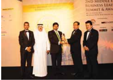
Middle East Business Leaders Award 2011 Masterclass Visionary CEO of the Year