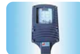
PTL-LED 24W / 12V