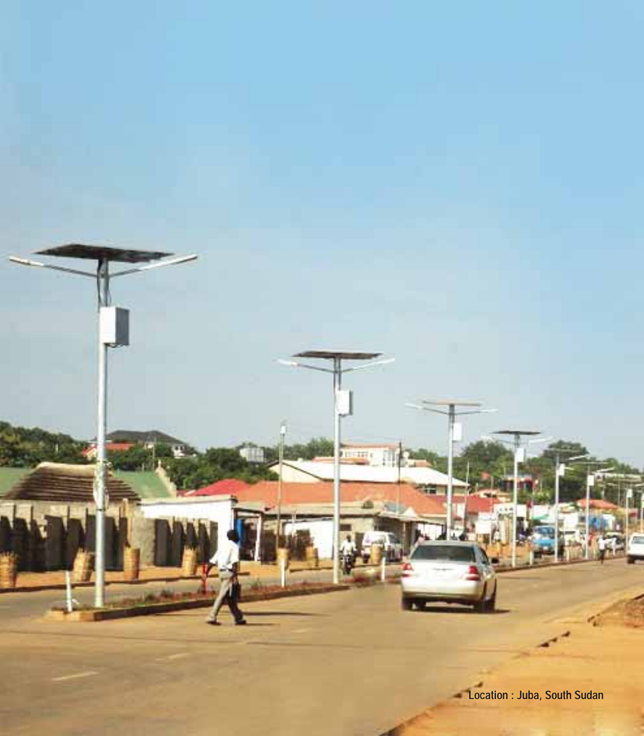
Location : Juba, South Sudan