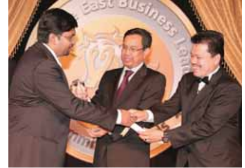
Middle East Business Leaders Award 2010 Power and Energy Sector