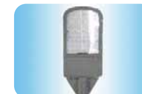
PTL-LED 100W / 24V